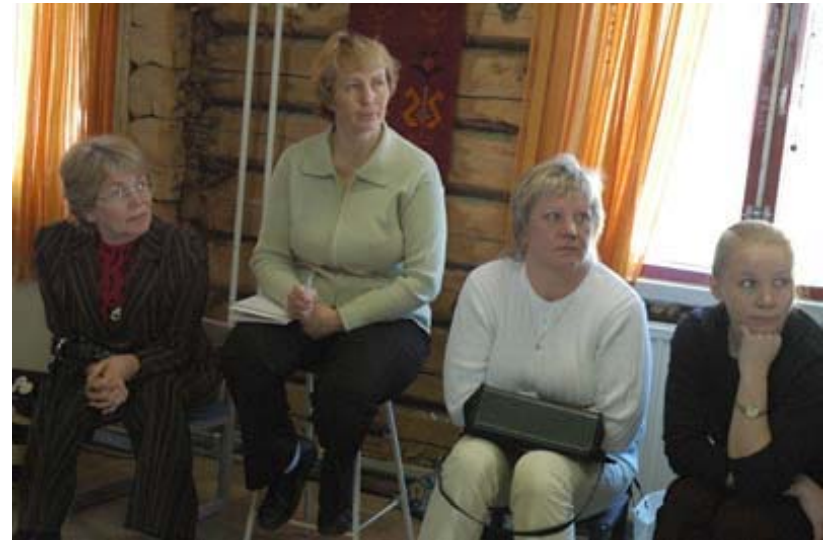
Key persons of the village visiting a village house in Kajaani